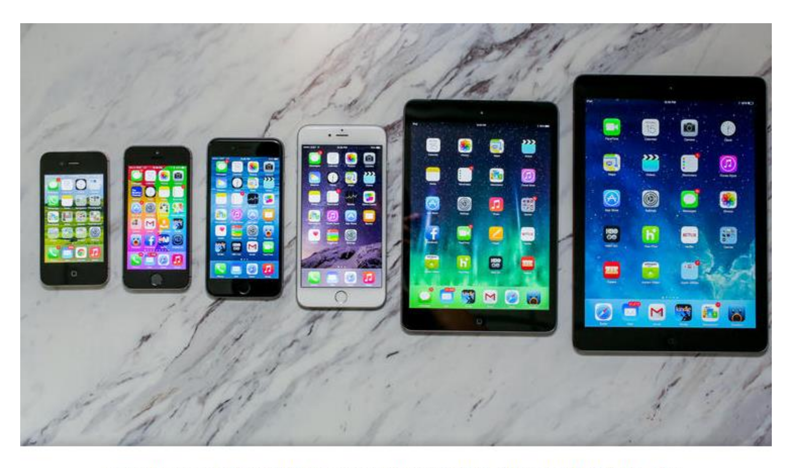
A handy comparison of all iOS screen sizes: 4S, 5S, 6, 6 Plus, iPad Mini, iPad Air.